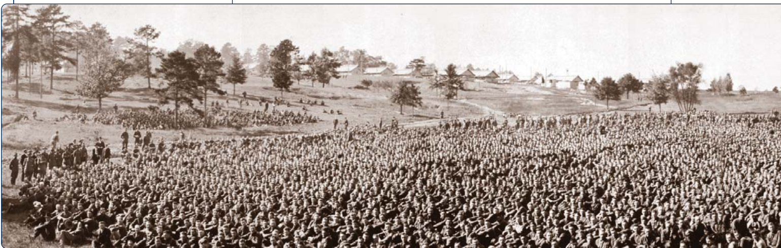
Top: The 41st Division poses for a group portrait at Camp Greene.