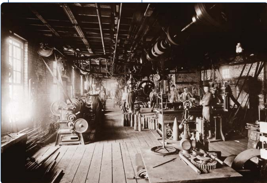
Above: The Raleigh Iron Works made explosive shell casings for artillery during World War I.

this war, for the first time, North Carolinians fought in units with soldiers from other states. One army division, called “Old Hickory” after President Andrew Jackson, was made up primarily of North Carolinians. It helped break the German defensive line at a crucial point in the war.