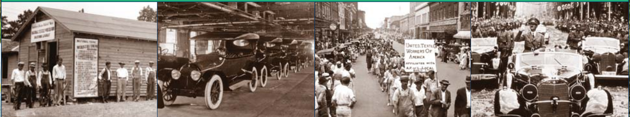
Figure 24 Timeline: 1920–1945