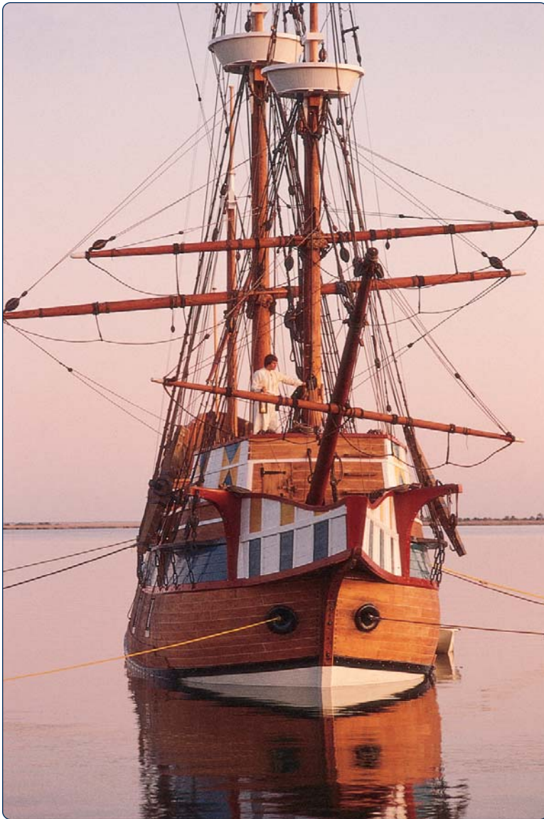
Above: A visit to the Elizabeth II in Manteo gives an idea of what shipboard life was like in the sixteenth century.

supplies. White left to return to England to bring back needed supplies. He left behind a new granddaughter, Virginia Dare, born August 18, 1587. Virginia Dare was the first baby born to English settlers in the New World and, in a sense, the very first native white North Carolinian.