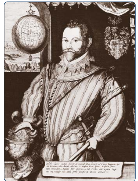
Above: In 1588, Sir Francis Drake was too busy defending England and helping defeat the Armada to worry about the Roanoke colony. Below: This painting imagines the baptism of Virginia Dare.

The settlement quickly ran into many of the same difficulties experienced previously. Despite the help of Manteo, the colony ran short of