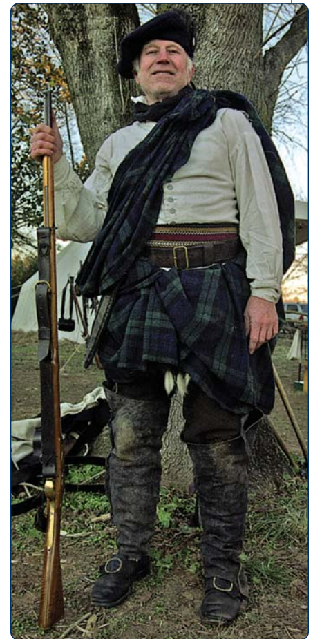
Above: This Revolutionary War reenactor is dressed as a Highland Scot Tory.

8.2.04 Examine the reasons for the colonists' victory, the impact of military successes and failures, the role of foreign interventions, and on-going domestic issues.